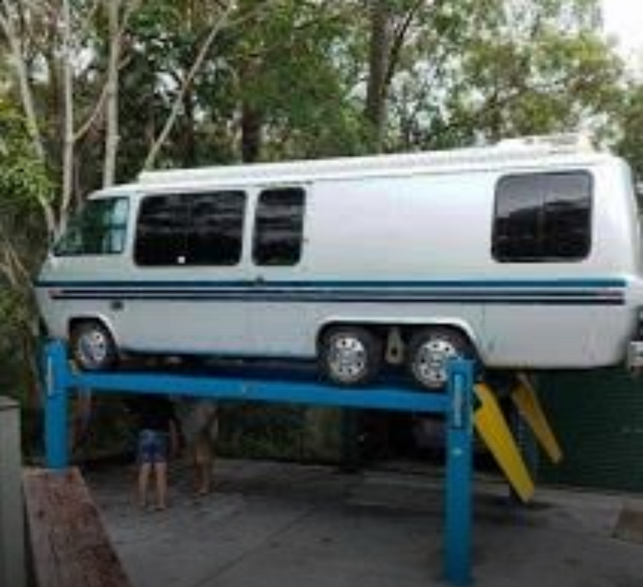
Classic CL6500-4P 6.5T 4 Post Hoist